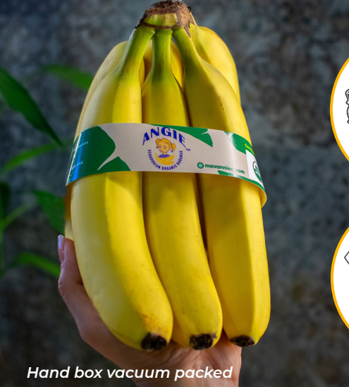
Hand box vacuum packed