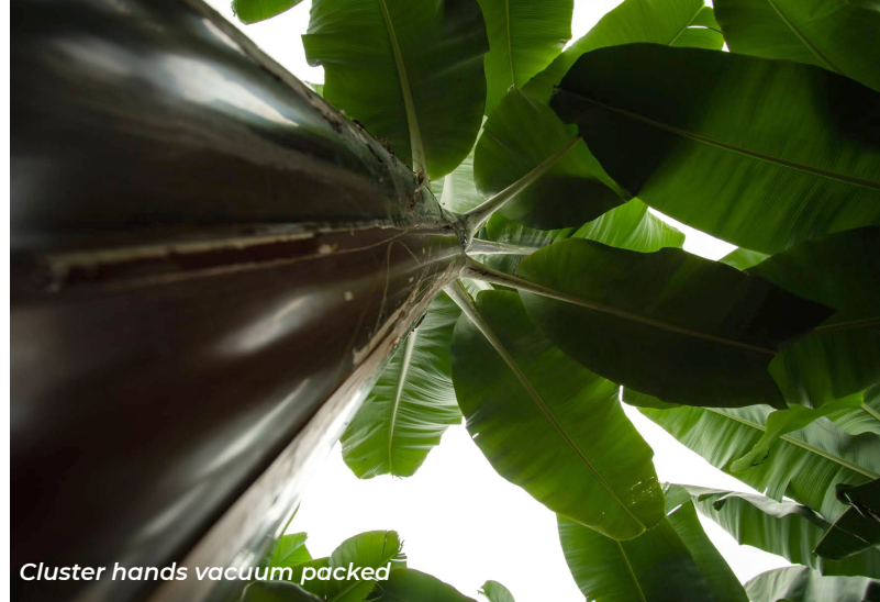
Cluster hands vacuum packed